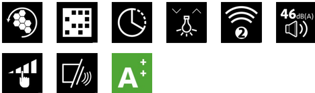
8550_NorBreeze GREGAL 60 WH NMOTION