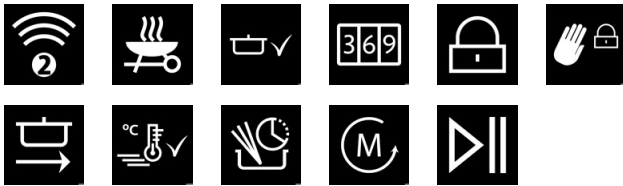
4133_NorCook IH N6286 BK